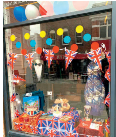
For May's coronation we dressed our window to celebrate and our customers loved it!

Each one of the Shop Volunteers has a special skill which they put to good use. Every one of them does over and above what is required of them. Our regular customers come in most days for a chat with our staff, and always say how helpful our staff are. We love getting donations in, we never know what to expect!